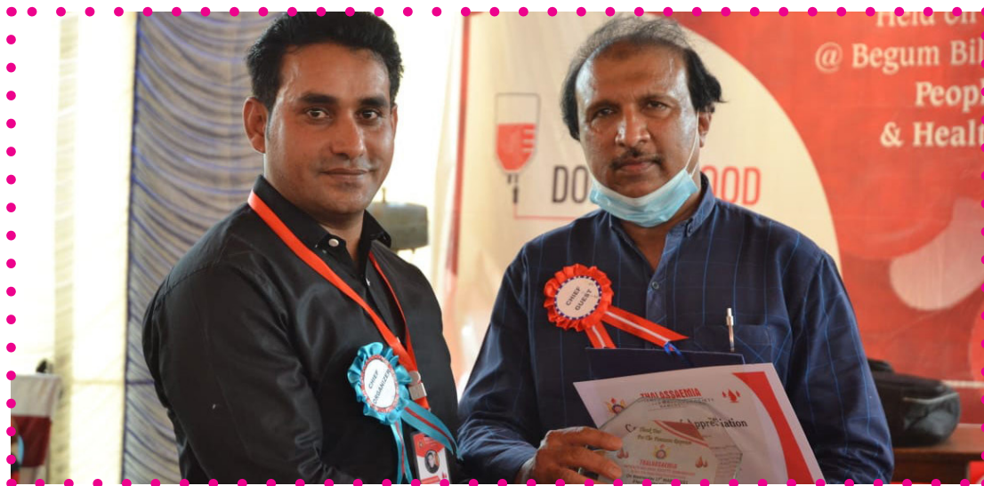
Chief organiser Blood Donation camp at BBS-ION, PUMHSW New campus