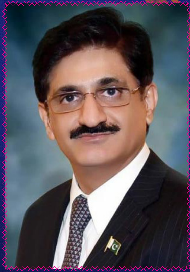
Syed Murad Ali Shah Chief Minister Sindh